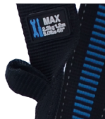
2.3kg tool loop

Captive pin double lock carabiner both ends.