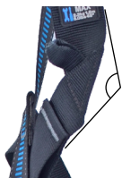
Patented hip fold

Captive pin double lock carabiner both ends.