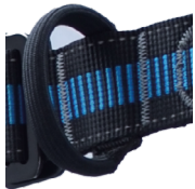
Soft UHMPE front attachment loop