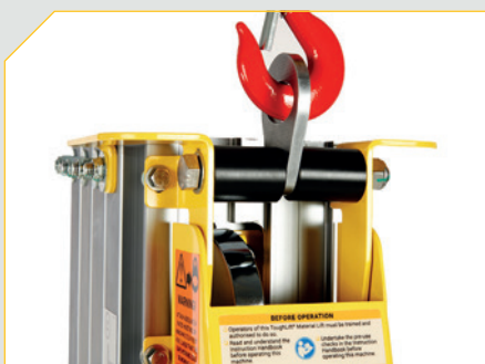
Hoisting and winching anchor.