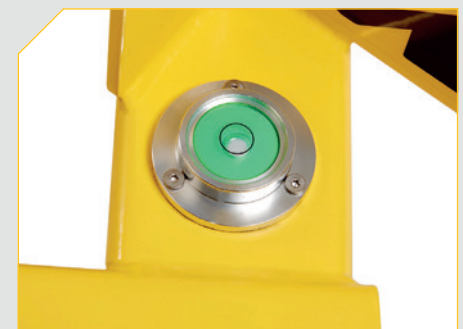
Spirit level to aid the operator to level the chassis.