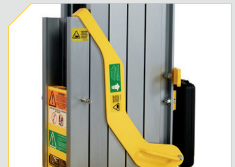
Carriage lock operates in all machine configurations.