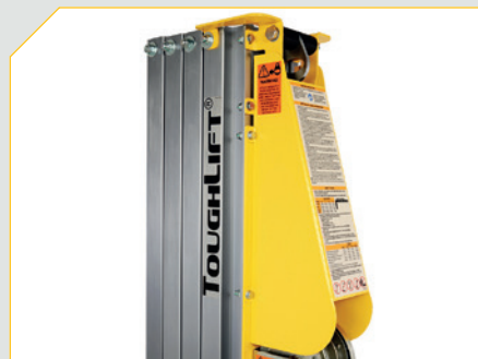
Cable guard with operational and safety decal.