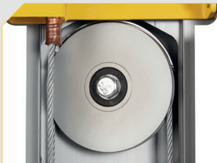
Hard wearing aluminium mast pulley wheels.