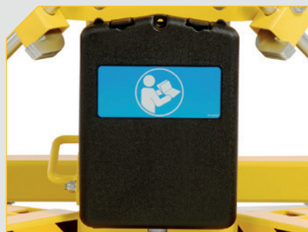
Robust waterproof document holder.