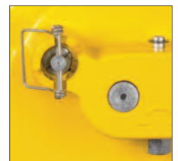
Manual drum-lock for an easy exchange of the rope. All s with capacity more than 5 kg.