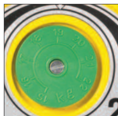
Load indicator for models YBF-09 up to YBF-70 YBF-22L up to YBF-70L YBA-15 up to YBA-70 YBA-22L up to YBA-70L