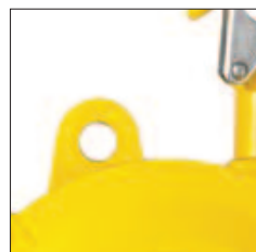
Suspension eye according to DIN 15112 spring balancers must be equipped with additional suspension eyes for the attachment of secondary safety chains.